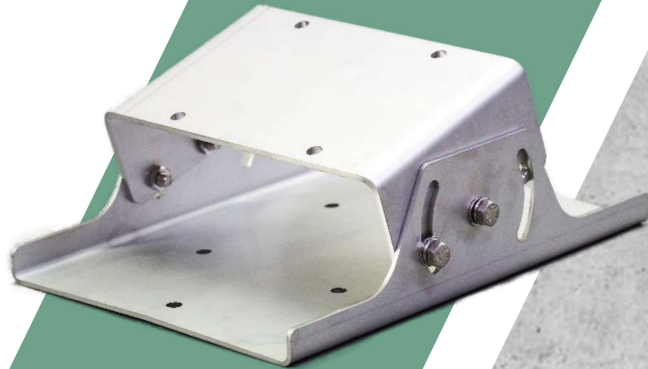
Stainless steel wall mount